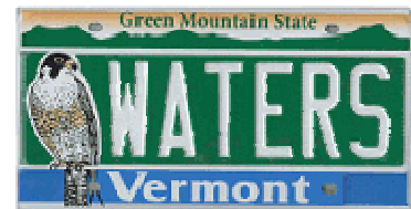
Conservation License Plate