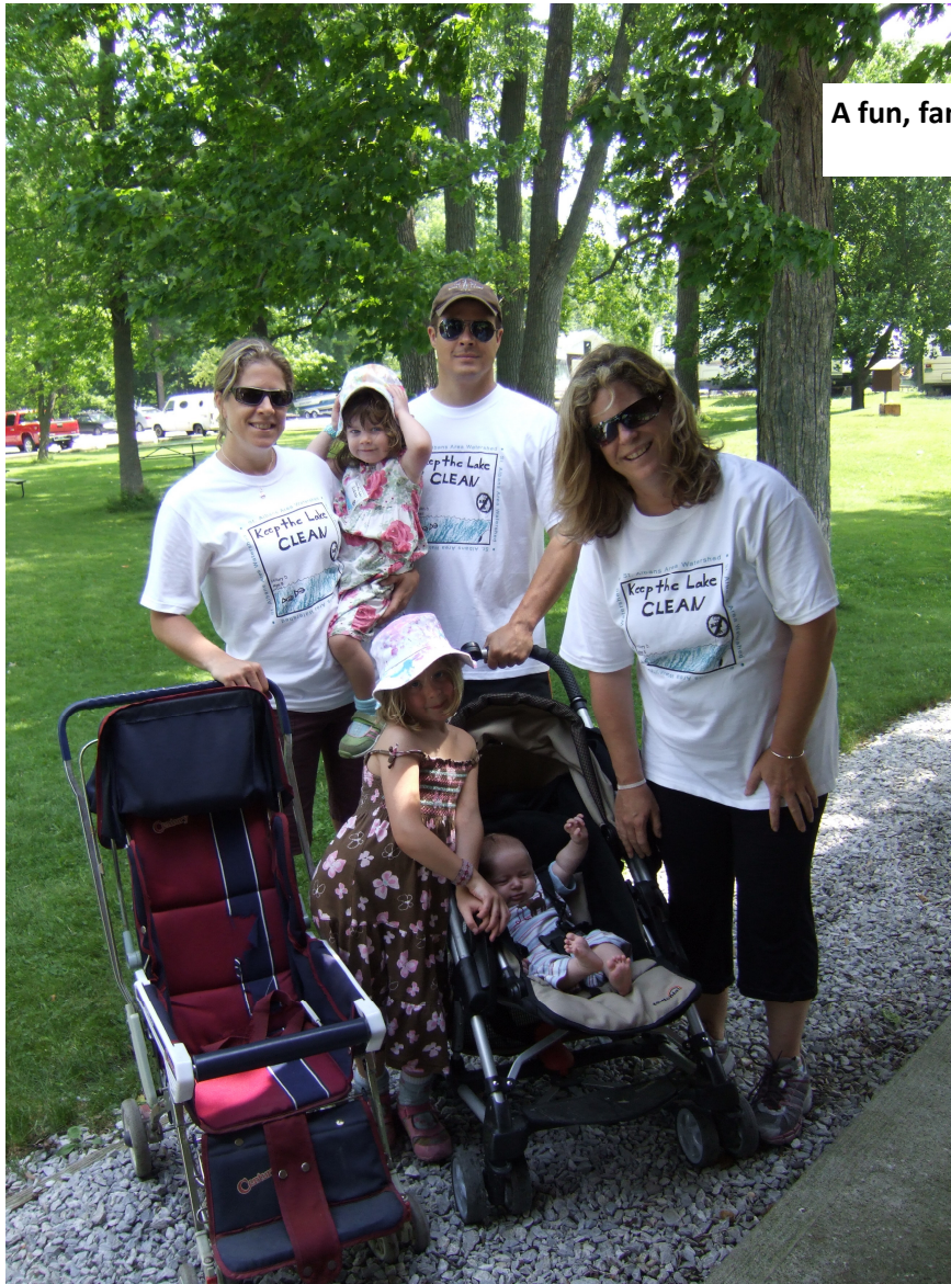
A fun, family oriented event encouraging everyone to participate