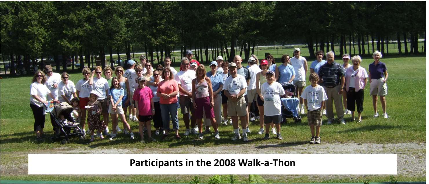
Participants in the 2008 Walk-a-Thon