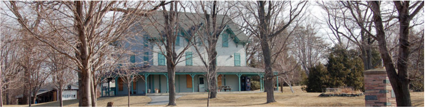
Kill Kare State Park Destination of June 6, 2009 Walk-a-Thon